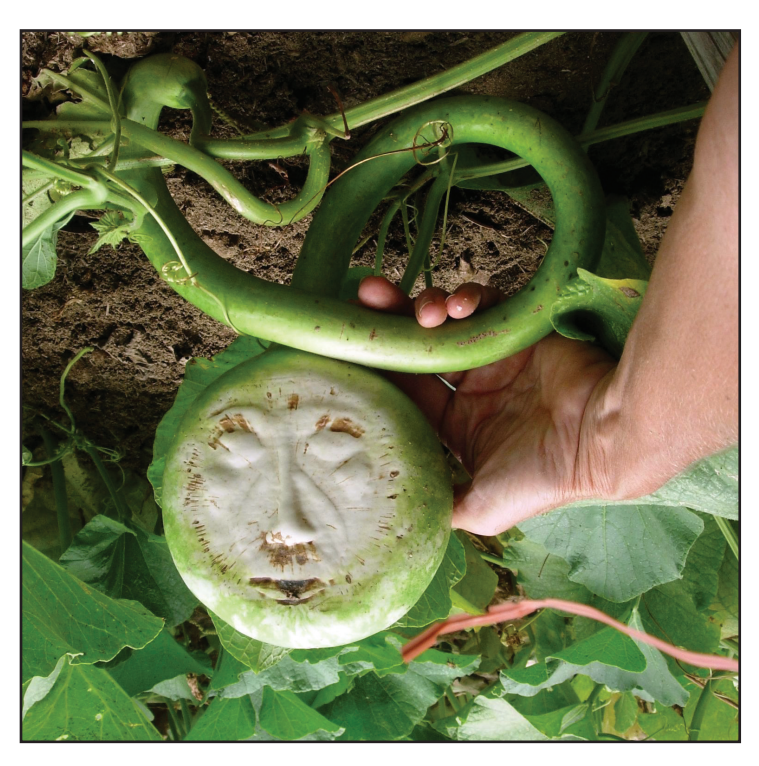
Photo 6. Instead of a plain flat mold try carving a reverse-pattern in the wood such as this face. Remember not to carve any undercuts or you will not be able to get the wood mold off.

11. Here is an example of a gourd that out-grew it's mold. It will also have a dent where the threaded screw is touching. [Photo 5]